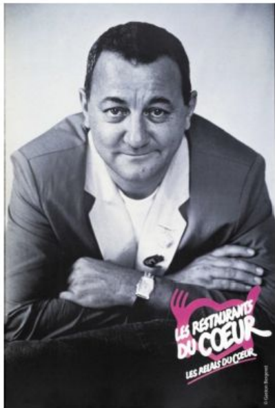
Coluche, French humorist

Coluche founded in 1985 Les Restos du Cœur, with one purpose : « to help and provide assistance to those in need, particularly regarding food insecurity through access to free meals, thereby encouraging social inclusion as well as any action against poverty in all its forms »